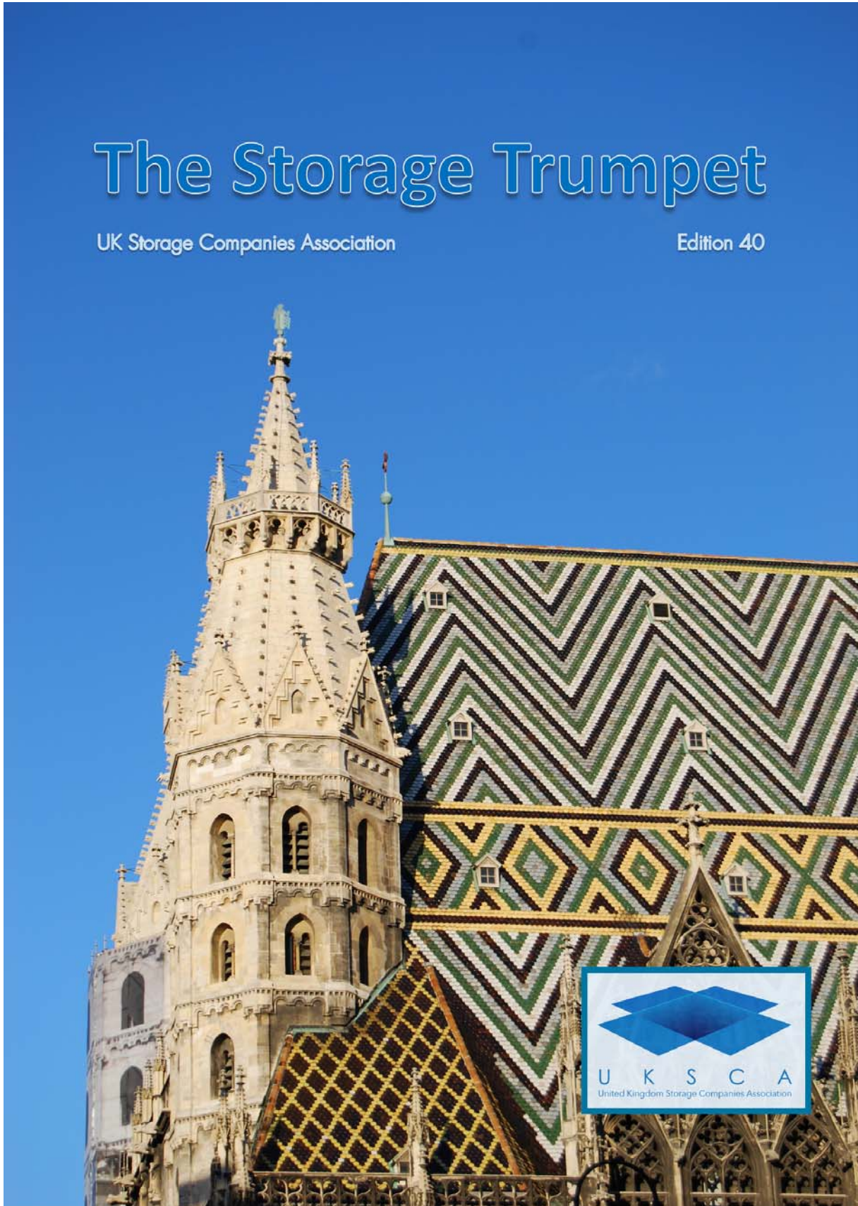
Figure 1 – Example Front Cover (UK Edition 40)